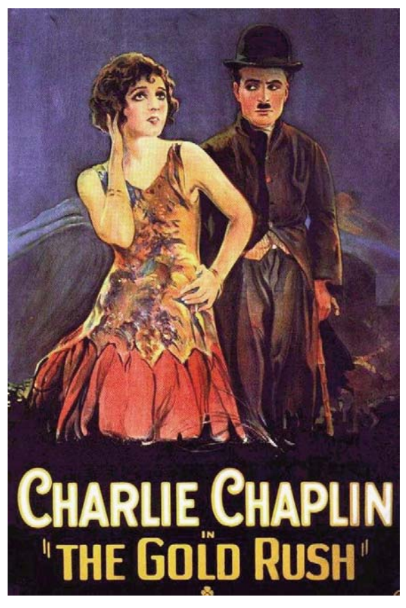
Figure 5.- A good film for smiling

The Gold Rush (1925) and The Great Dictator (1940) by Charles Chaplin, and It's a Mad Mad Mad World (1963) by Stanley Kramer (Figure 5).